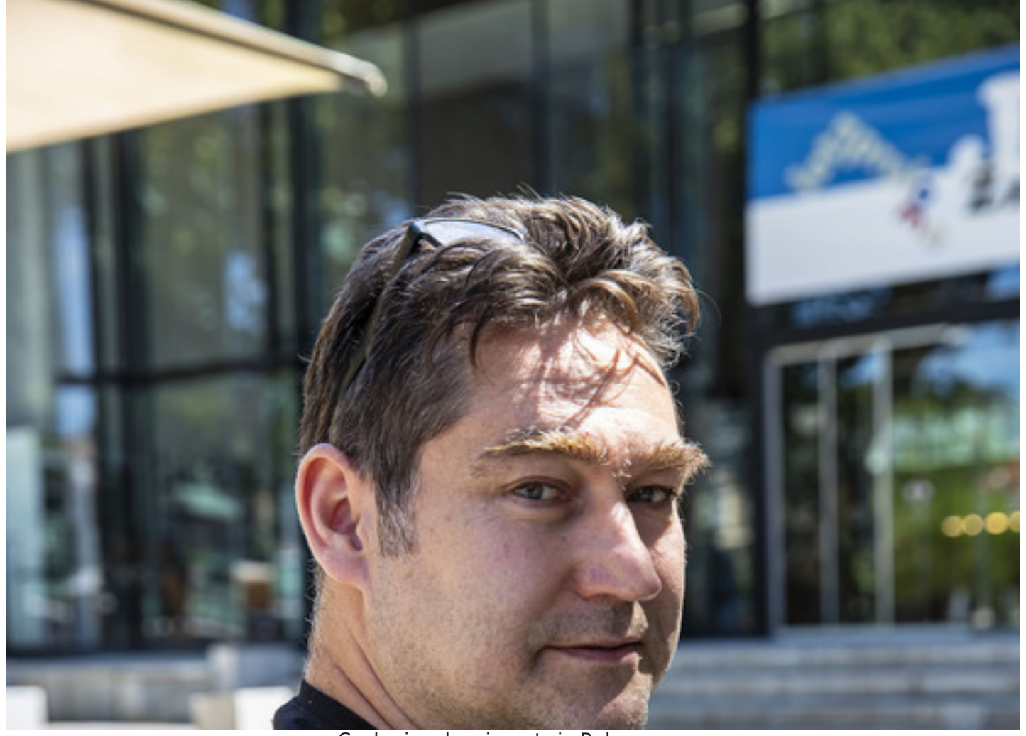
Cankarjev dom invests in Robe SPOTES