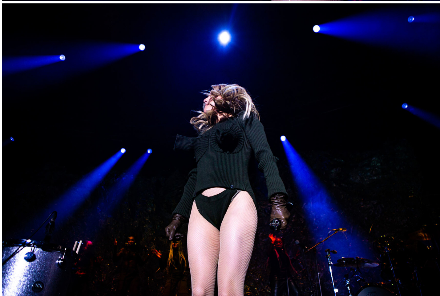
Roundhouse Rounds off All Robe Moving Light Rig with new ESPRITES